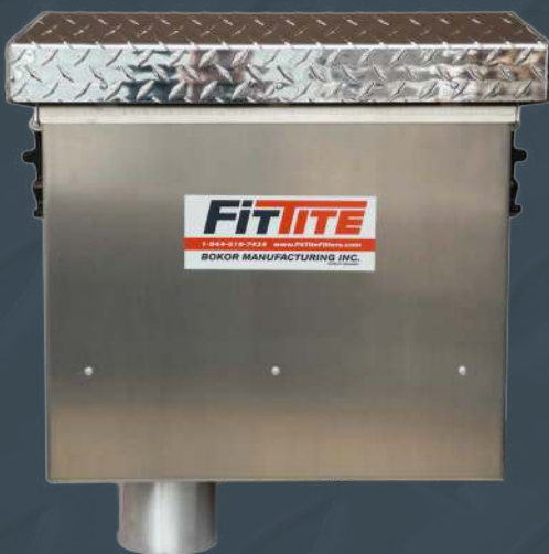
FitTite Filter Housing Unit (left hand model shown)