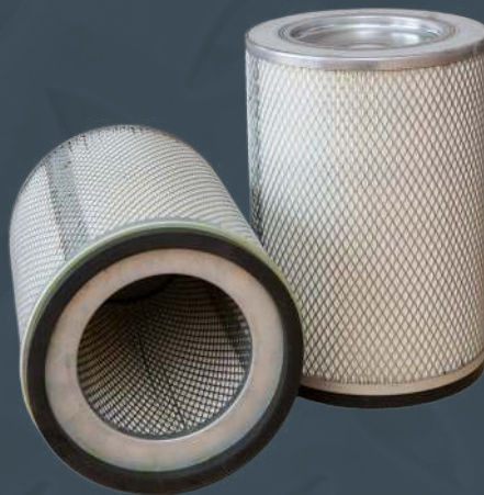
2 Filter Elements