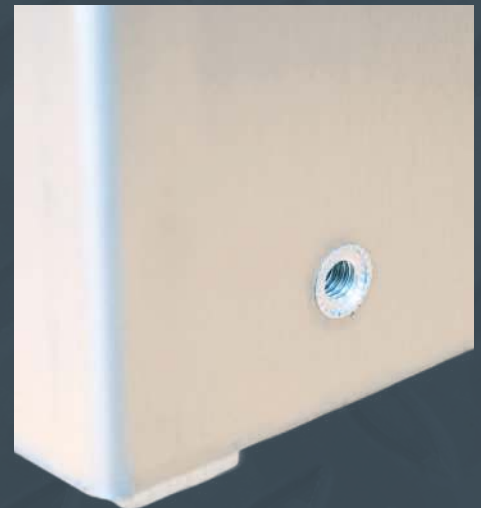
Built-in Threaded Rivet Inserts For Mounting